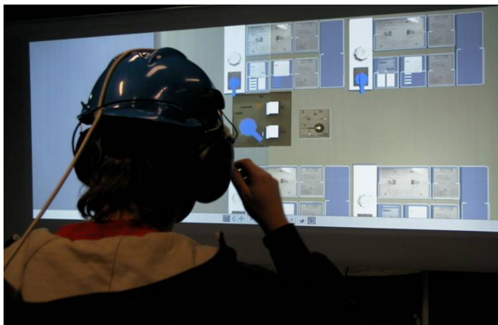
Figure 2. Operator in front of the VR model of the plant.

If the operator requested to enter a room that was not modelled, an empty room appeared on the large screen display. When entering such a room, the operators had to contact the experimental staff to tell them what operations the operator wanted to perform. The purpose of including the empty room was to avoid having to model all the rooms in the plant, but still make the entire plant available to the operators.